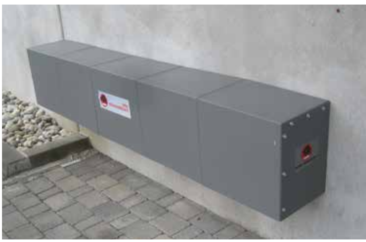
Watertight cover for storing the barrier panels

You can find more information at: UK.PREFA.COM/PRODUCT-CATALOGUE/FLOOD-PROTECTION-SOLUTIONS