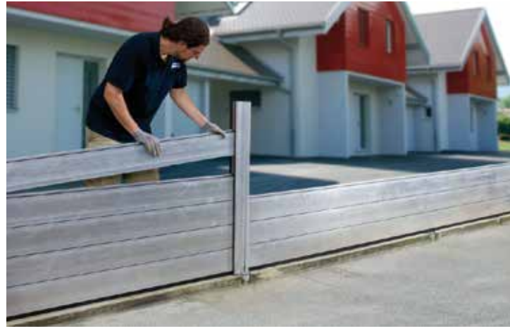
Perimeter protection: quick and easy mounting by one person